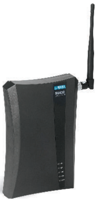
SIMADO GFXD1111S 3G