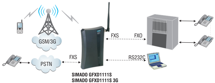
(FXS) with PBX (FXO) Application